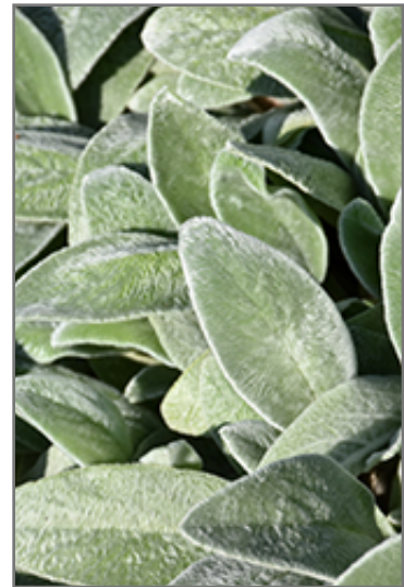
Lamb's Ears foliage

Lamb's Ears is recommended for the following landscape applications;