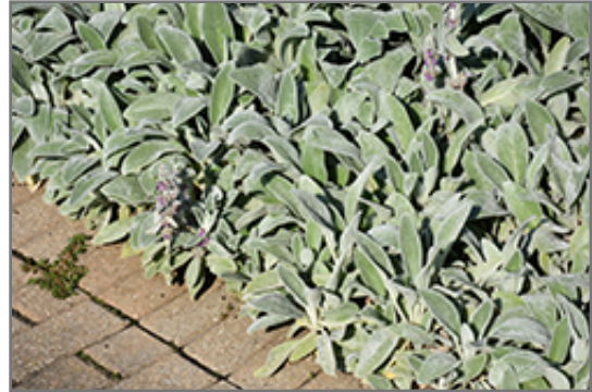
Lamb's Ears

Lamb's Ears will grow to be about 12 inches tall at maturity extending to 24 inches tall with the flowers, with a spread of 18 inches. When grown in masses or used as a bedding plant, individual plants should be spaced approximately 15 inches apart. Its foliage tends to remain dense right to the ground, not requiring facer plants in front. It grows at a fast rate, and under ideal conditions can be expected to live for approximately 10 years. As an herbaceous perennial, this plant will usually die back to the crown each winter, and will regrow from the base each spring. Be careful not to disturb the crown in late winter when it may not be readily seen!