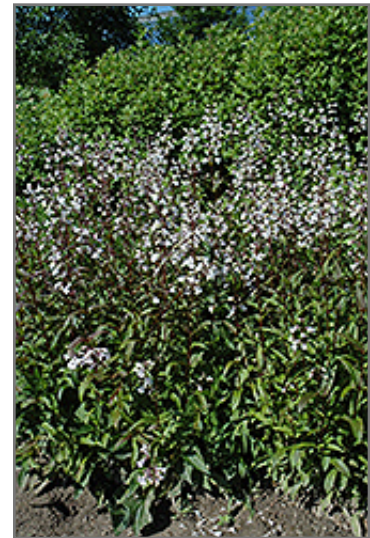
Husker Red Beard Tongue in bloom

Husker Red Beard Tongue is a fine choice for the garden, but it is also a good selection for planting in outdoor pots and containers. With its upright habit of growth, it is best suited for use as a 'thriller' in the 'spiller-thriller-filler' container combination; plant it near the center of the pot, surrounded by smaller plants and those that spill over the edges. Note that when growing plants in outdoor containers and baskets, they may require more frequent waterings than they would in the yard or garden.