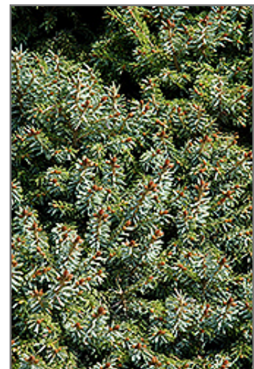
Dwarf Serbian Spruce foliage