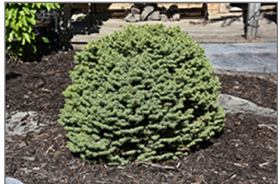
Dwarf Serbian Spruce