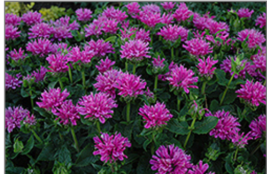
Petite Delight Beebalm flowers