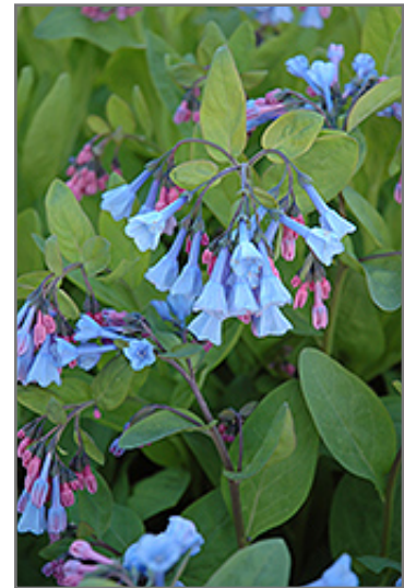
Virginia Bluebells flowers