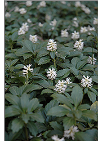
Japanese Spurge flowers