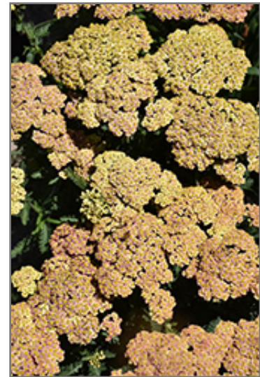
Firefly Peach Sky Yarrow flowers

Firefly Peach Sky Yarrow is recommended for the following landscape applications;