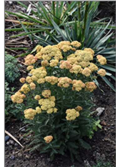
Firefly Peach Sky Yarrow in bloom