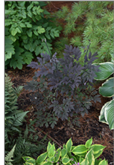
Chocoholic Bugbane