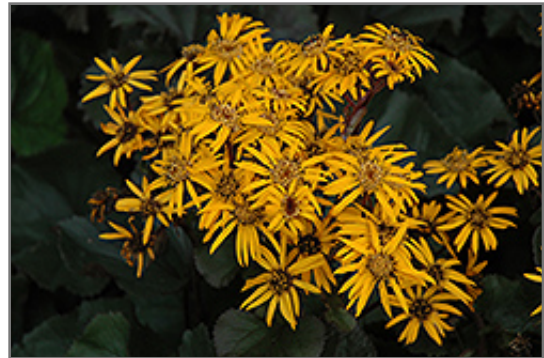
Britt Marie Crawford Rayflower flowers