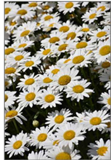
Becky Shasta Daisy flowers