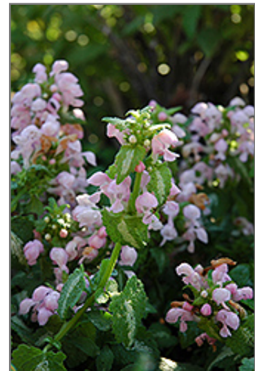
Shell Pink Spotted Dead Nettle flowers