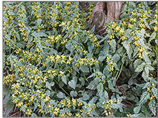
Hermann's Pride Yellow Archangel in bloom

This plant does best in partial shade to shade. It is an amazingly adaptable plant, tolerating both dry conditions and even some standing water. It is considered to be drought-tolerant, and thus makes an ideal choice for a low-water garden or xeriscape application. It is not particular as to soil type or pH. It is highly tolerant of urban pollution and will even thrive in inner city environments. This is a selected variety of a species not originally from North America. It can be propagated by division; however, as a cultivated variety, be aware that it may be subject to certain restrictions or prohibitions on propagation.