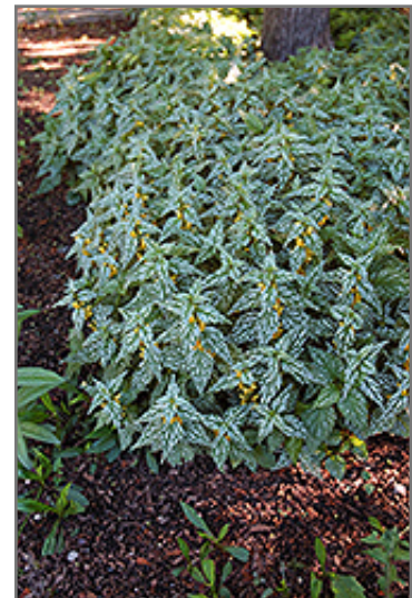
Hermann's Pride Yellow Archangel in bloom