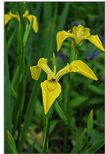
Yellow Flag Iris flowers