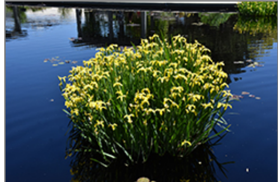
Yellow Flag Iris in bloom