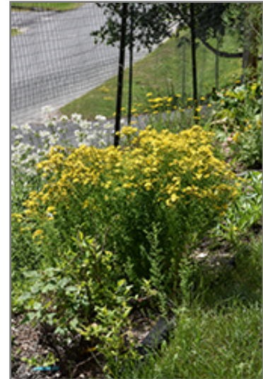
St. John's Wort in bloom