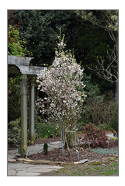
Zuzu Fuji Cherry in bloom

This shrub should only be grown in full sunlight. It does best in average to evenly moist conditions, but will not tolerate standing water. It is not particular as to soil pH, but grows best in rich soils. It is highly tolerant of urban pollution and will even thrive in inner city environments, and will benefit from being planted in a relatively sheltered location. This is a selected variety of a species not originally from North America.