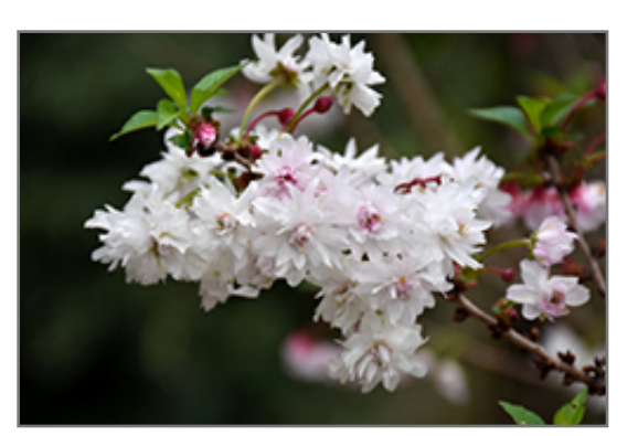
Zuzu Fuji Cherry flowers