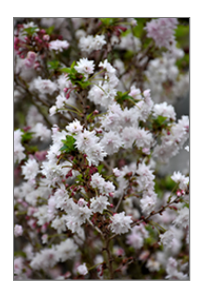
Zuzu Fuji Cherry flowers