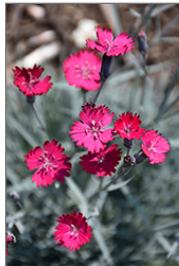
Wicked Witch Pinks flowers

Wicked Witch Pinks is recommended for the following landscape applications;