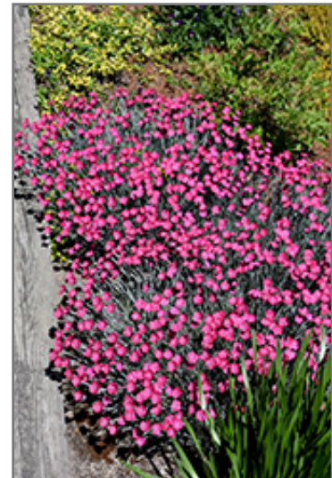
Wicked Witch Pinks in bloom

Wicked Witch Pinks is recommended for the following landscape applications;