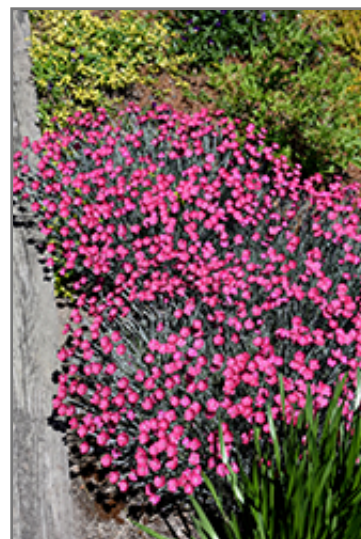
Wicked Witch Pinks in bloom