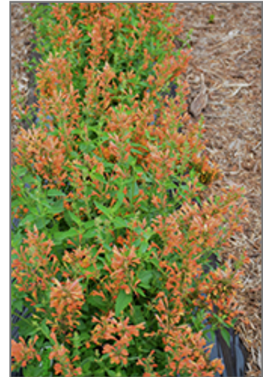
Poquito Orange Hyssop in bloom