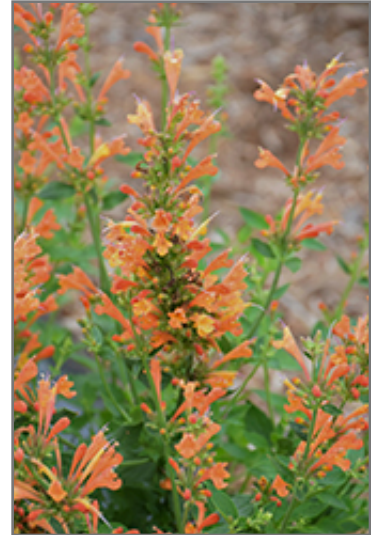
Poquito Orange Hyssop flowers

Poquito Orange Hyssop is a fine choice for the garden, but it is also a good selection for planting in outdoor pots and containers. It is often used as a 'filler' in the 'spiller-thriller-filler' container combination, providing a mass of flowers against which the larger thriller plants stand out. Note that when growing plants in outdoor containers and baskets, they may require more frequent waterings than they would in the yard or garden.