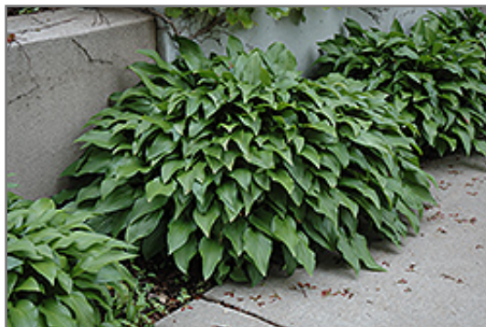
Invincible Hosta

Invincible Hosta is recommended for the following landscape applications;