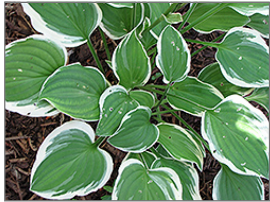
Diamond Tiara Hosta foliage

Diamond Tiara Hosta will grow to be about 12 inches tall at maturity extending to 18 inches tall with the flowers, with a spread of 24 inches. When grown in masses or used as a bedding plant, individual plants should be spaced approximately 20 inches apart. Its foliage tends to remain dense right to the ground, not requiring facer plants in front. It grows at a medium rate, and under ideal conditions can be expected to live for approximately 10 years. As an herbaceous perennial, this plant will usually die back to the crown each winter, and will regrow from the base each spring. Be careful not to disturb the crown in late winter when it may not be readily seen!