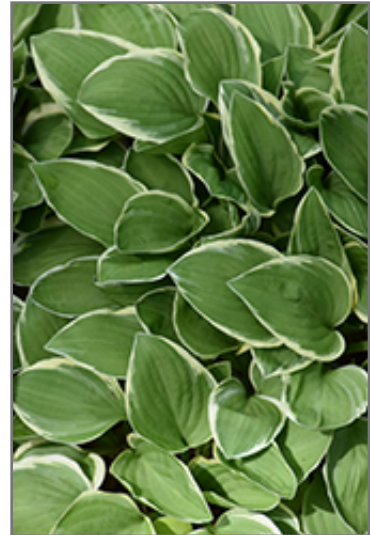
Diamond Tiara Hosta foliage