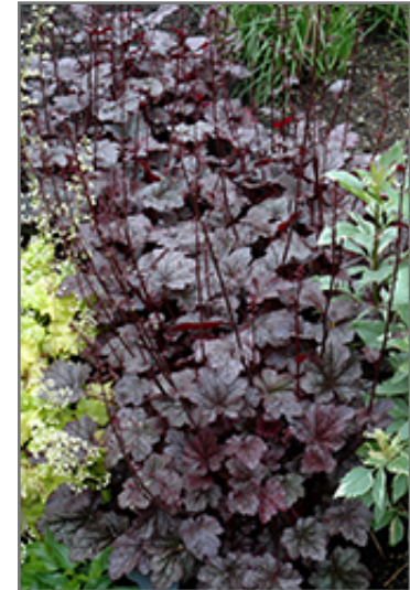
Plum Pudding Coral Bells in bloom