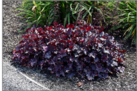
Plum Pudding Coral Bells

Plum Pudding Coral Bells will grow to be only 6 inches tall at maturity extending to 12 inches tall with the flowers, with a spread of 12 inches. When grown in masses or used as a bedding plant, individual plants should be spaced approximately 10 inches apart. Its foliage tends to remain low and dense right to the ground. It grows at a medium rate, and under ideal conditions can be expected to live for approximately 10 years. As an evergreen perennial, this plant will typically keep its form and foliage year-round.