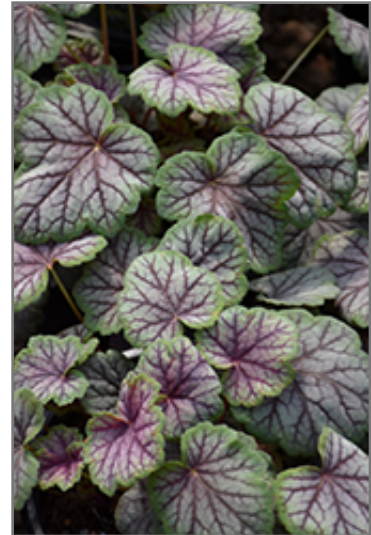
Green Spice Coral Bells foliage