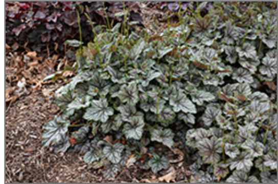
Green Spice Coral Bells

Green Spice Coral Bells will grow to be about 10 inches tall at maturity extending to 24 inches tall with the flowers, with a spread of 12 inches. When grown in masses or used as a bedding plant, individual plants should be spaced approximately 10 inches apart. Its foliage tends to remain low and dense right to the ground. It grows at a medium rate, and under ideal conditions can be expected to live for approximately 10 years. As an evergreen perennial, this plant will typically keep its form and foliage year-round.