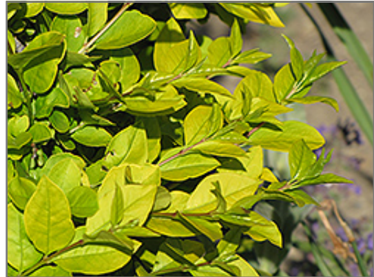
Golden Privet foliage