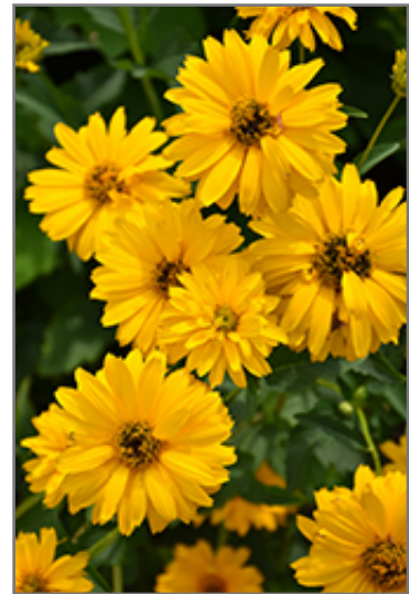
Summer Sun False Sunflower flowers

Summer Sun False Sunflower is recommended for the following landscape applications;