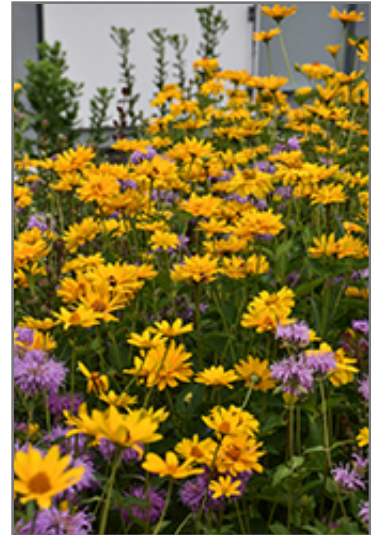
Summer Sun False Sunflower flowers