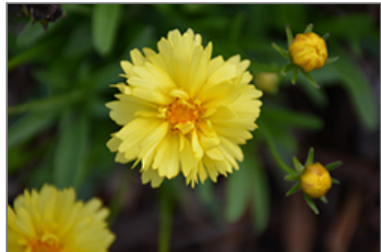
Leading Lady Charlize Tickseed flowers