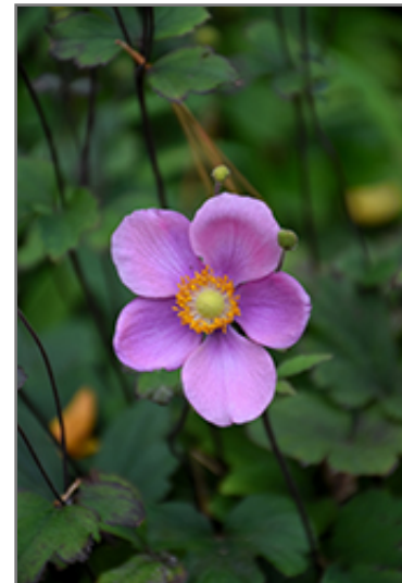
Lucky Charm Anemone flowers