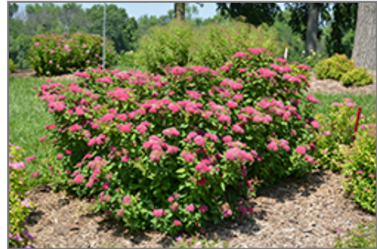
Double Play Red Spirea in bloom