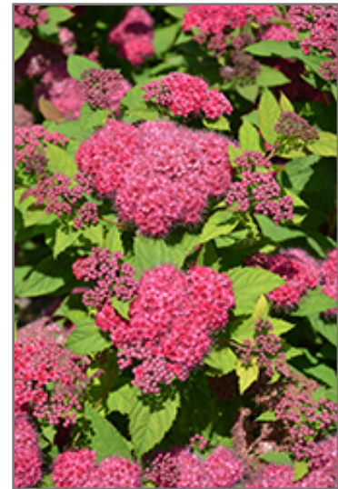
Double Play Red Spirea flowers

Double Play Red Spirea is recommended for the following landscape applications;