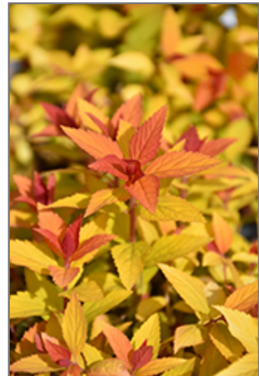
Double Play Candy Corn Spirea foliage

Double Play Candy Corn Spirea is recommended for the following landscape applications;