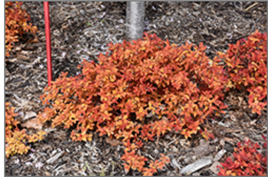
Double Play Candy Corn Spirea

This shrub should only be grown in full sunlight. It prefers to grow in average to moist conditions, and shouldn't be allowed to dry out. It is not particular as to soil type or pH. It is highly tolerant of urban pollution and will even thrive in inner city environments. This is a selected variety of a species not originally from North America.