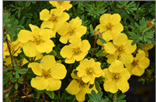
Happy Face Yellow Potentilla flowers

Happy Face Yellow Potentilla is recommended for the following landscape applications;