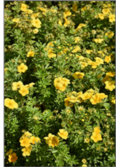
Happy Face Yellow Potentilla flowers

This shrub does best in full sun to partial shade. It is very adaptable to both dry and moist locations, and should do just fine under typical garden conditions. It is considered to be drought-tolerant, and thus makes an ideal choice for a low-water garden or xeriscape application. It is not particular as to soil type or pH. It is highly tolerant of urban pollution and will even thrive in inner city environments. This is a selection of a native North American species.