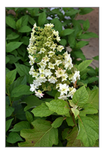
Gatsby Star Hydrangea flowers

A distinctive, showy oakleaf hydrangea featuring impressively large, full panicles of white double flowers with pointed petals; blooms will turn pink in fall; burgundy fall foliage color; blooms on old wood; a great selection for gardens and borders