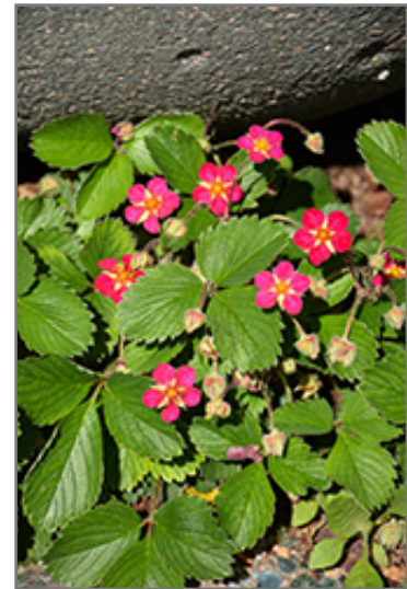
Lipstick Strawberry flowers

Lipstick Strawberry has masses of beautiful cherry red daisy flowers with yellow eyes along the stems from late spring to early summer, which are most effective when planted in groupings. Its tomentose round compound leaves remain green in color throughout the season. It features an abundance of magnificent red berries from mid spring to mid fall.