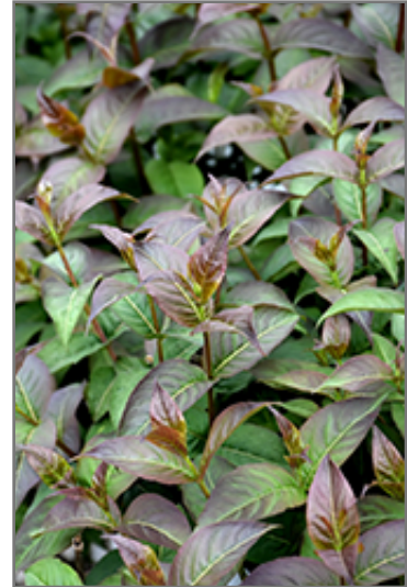
Kodiak Black Diervilla foliage

Kodiak Black Diervilla makes a fine choice for the outdoor landscape, but it is also well-suited for use in outdoor pots and containers. Because of its height, it is often used as a 'thriller' in the 'spiller-thriller-filler' container combination; plant it near the center of the pot, surrounded by smaller plants and those that spill over the edges. It is even sizeable enough that it can be grown alone in a suitable container. Note that when grown in a container, it may not perform exactly as indicated on the tag - this is to be expected. Also note that when growing plants in outdoor containers and baskets, they may require more frequent waterings than they would in the yard or garden.