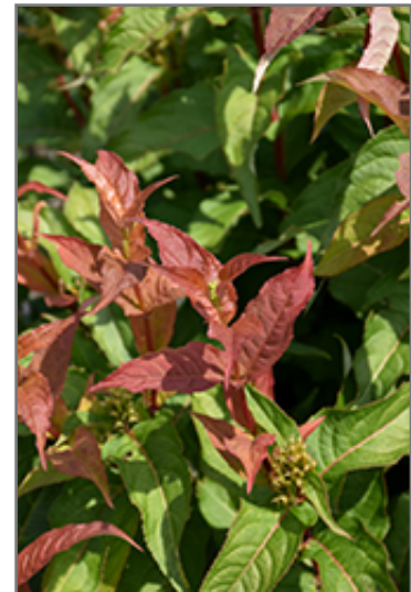
Kodiak Orange Diervilla foliage

Kodiak Orange Diervilla is recommended for the following landscape applications;