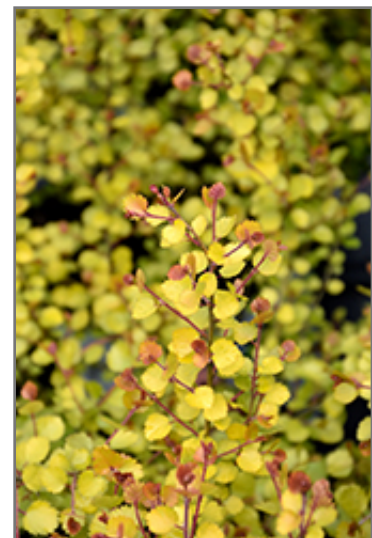
Cesky Gold Dwarf Birch foliage