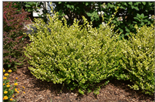
Cesky Gold Dwarf Birch