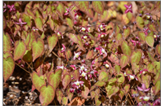
Bishop's Hat in bloom