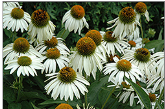
White Swan Coneflower flowers

White Swan Coneflower is recommended for the following landscape applications;