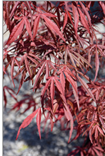
Red Spider Japanese Maple foliage