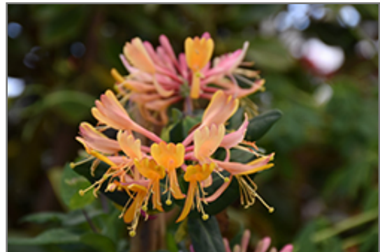
Goldflame Honeysuckle flowers