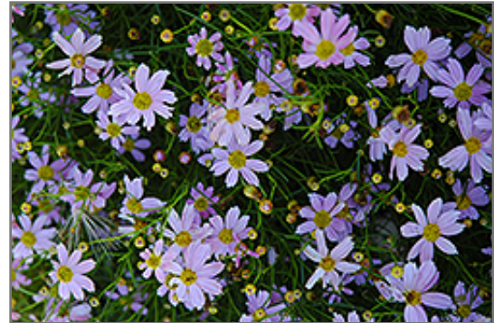
Pink Tickseed flowers