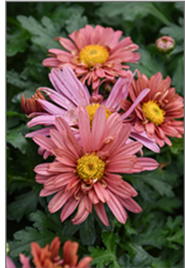
Coral Daisy Chrysanthemum flowers