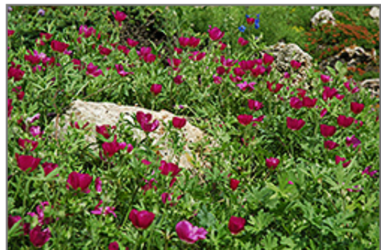
Buffalo Poppy flowers