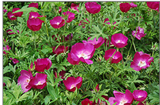
Buffalo Poppy flowers

Buffalo Poppy is recommended for the following landscape applications;