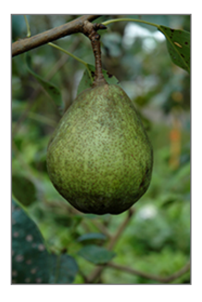
Kieffer Pear fruit