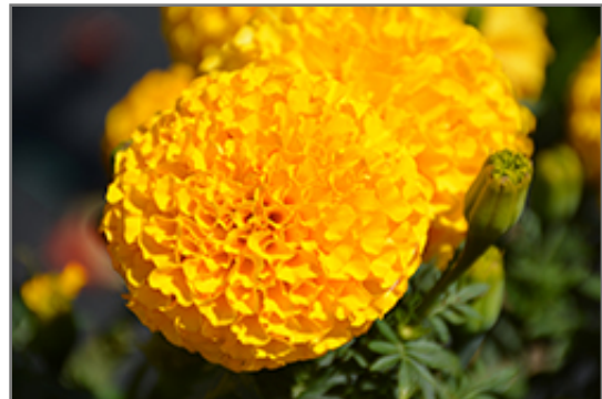
Taishan Gold Marigold flowers

Taishan Gold Marigold is recommended for the following landscape applications;