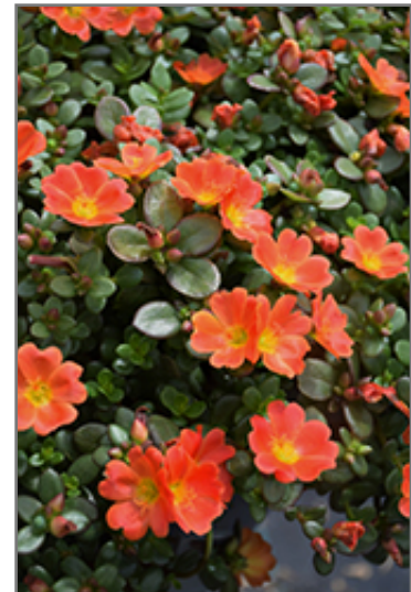
Mojave Tangerine Portulaca flowers

Mojave Tangerine Portulaca is recommended for the following landscape applications;