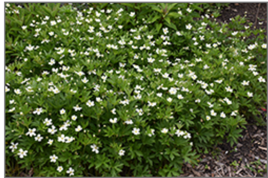
Windflower in bloom

Windflower will grow to be about 12 inches tall at maturity, with a spread of 18 inches. Its foliage tends to remain dense right to the ground, not requiring facer plants in front. It grows at a fast rate, and under ideal conditions can be expected to live for approximately 10 years. As an herbaceous perennial, this plant will usually die back to the crown each winter, and will regrow from the base each spring. Be careful not to disturb the crown in late winter when it may not be readily seen!