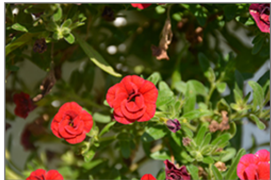
MiniFamous Double Compact Red Calibrachoa flowers