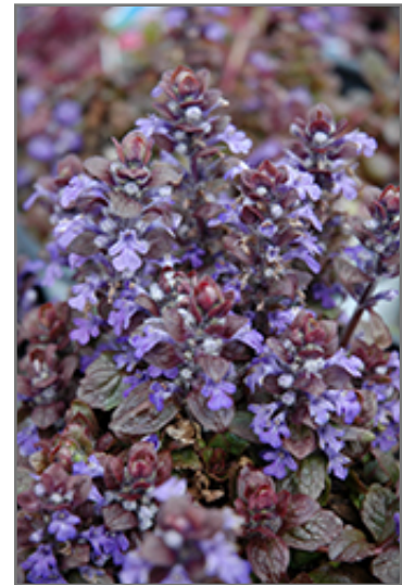
Bronze Beauty Bugleweed flowers

Bronze Beauty Bugleweed is recommended for the following landscape applications;