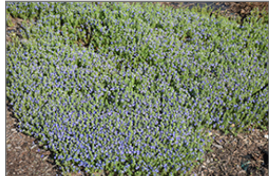
Tidal Pool Speedwell in bloom