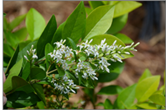
Golden Ticket Privet flowers

This shrub should only be grown in full sunlight. It is very adaptable to both dry and moist locations, and should do just fine under average home landscape conditions. It is not particular as to soil type or pH, and is able to handle environmental salt. It is highly tolerant of urban pollution and will even thrive in inner city environments. This particular variety is an interspecific hybrid.