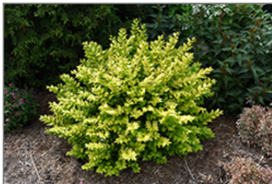
Golden Ticket Privet