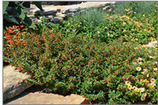
Vermillionaire Large Firecracker Plant in bloom