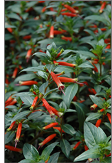
Vermillionaire Large Firecracker Plant flowers

Vermillionaire Large Firecracker Plant is a fine choice for the garden, but it is also a good selection for planting in outdoor pots and containers. With its upright habit of growth, it is best suited for use as a 'thriller' in the 'spiller-thriller-filler' container combination; plant it near the center of the pot, surrounded by smaller plants and those that spill over the edges. It is even sizeable enough that it can be grown alone in a suitable container. Note that when growing plants in outdoor containers and baskets, they may require more frequent waterings than they would in the yard or garden.