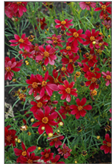
Red Satin Tickseed flowers