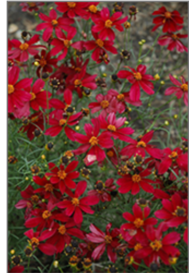
Red Satin Tickseed in bloom